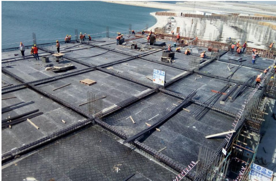
(Zone 3-Filter room slab and beams Shuttering and Steel Works)