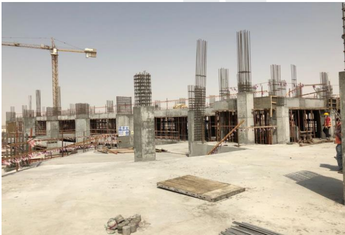
(Zone 2- Mezzanine Floor)