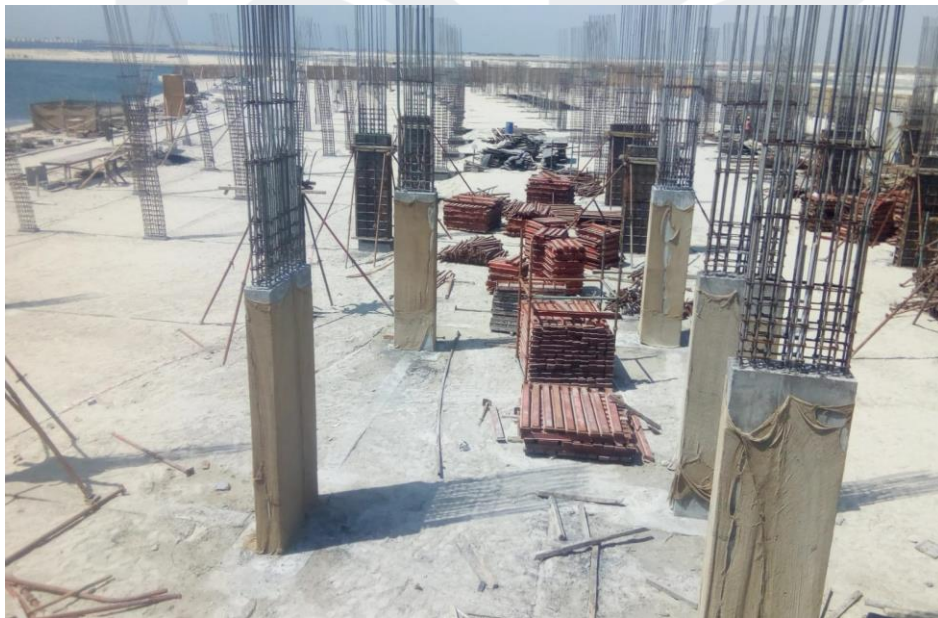
(Zone 4-Columns and Walls Works)